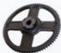
铸造链轮 Casting Sprocket