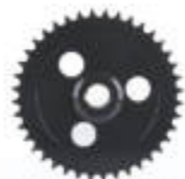
锥键槽链轮 Cone Keyway Sprocket