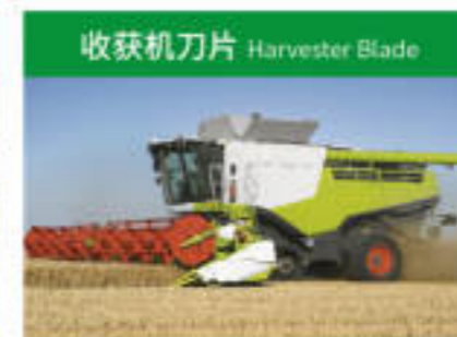
收获机刀片 Harvester Blade