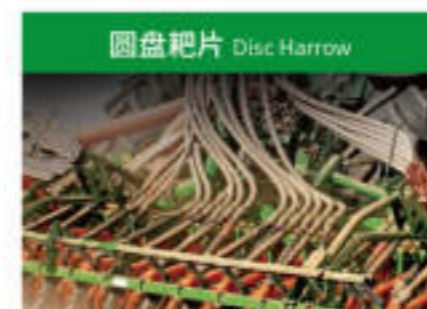
圆盘耙片 Disc Harrow