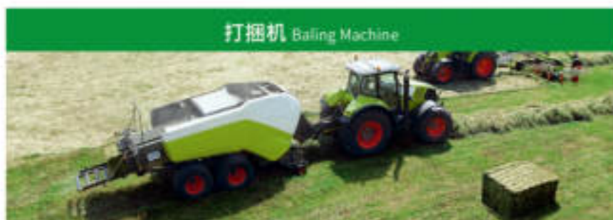
打捆机 Baling Machine