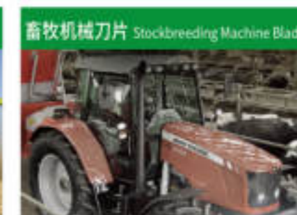
畜牧机械刀片 Stockbreeding Machine Blade