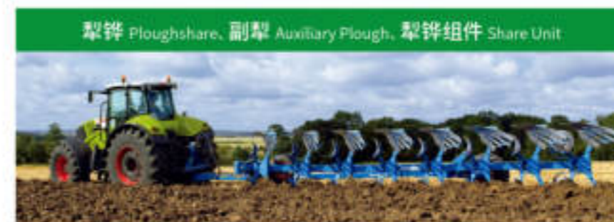
犁铧 Ploughshare, 副犁 Auxiliary Plough, 犁铧组件 Share Unit