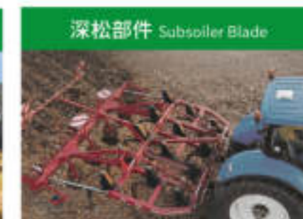
深松部件 Subsoiler Blade