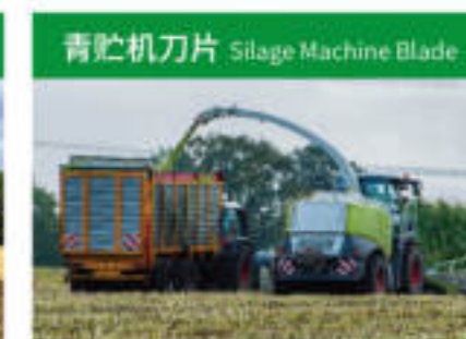
青贮机刀片 Silage Machine Blade