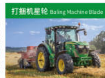
打捆机星轮 Baling Machine Blade