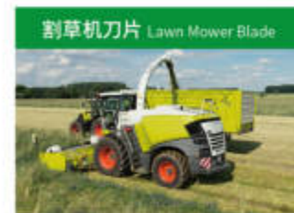
割草机刀片 Lawn Mower Blade