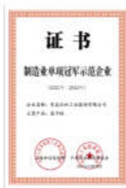
2021年获得国家制造业单项冠军示范企业 2021 The National Manufacturing Individual Champion Demonstration Enterprise