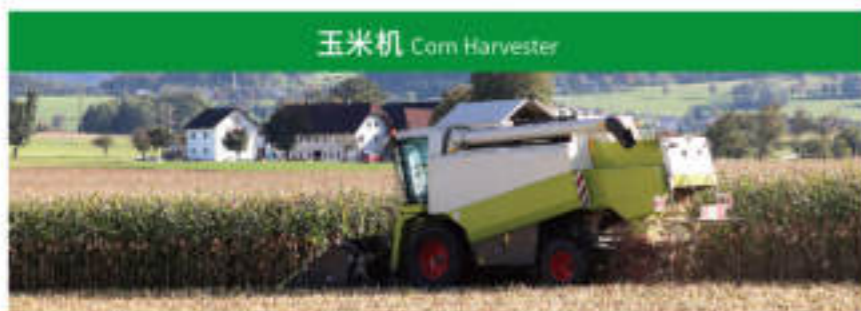
玉米机 Corn Harvester