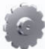
双节距链轮 Double Pitch Sprocket