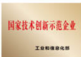
2017年获得行业首批国家技术创新示范企业 2017 The First Batch of National Technology Innovation Demonstration Enterprise

Now, CHOHO's leading product has advanced international level. CHOHO is responsible for several nationally significant research and development projects, has amended 24 national or industrial standard, and obtained more than 220 national invention and new model patents. CHOHO has performed the role of leading and instructing in the technology development of this industry.