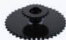
焊接链轮 Welding Sprocket