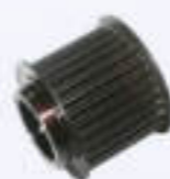
同步带轮 Synchronous Pulley